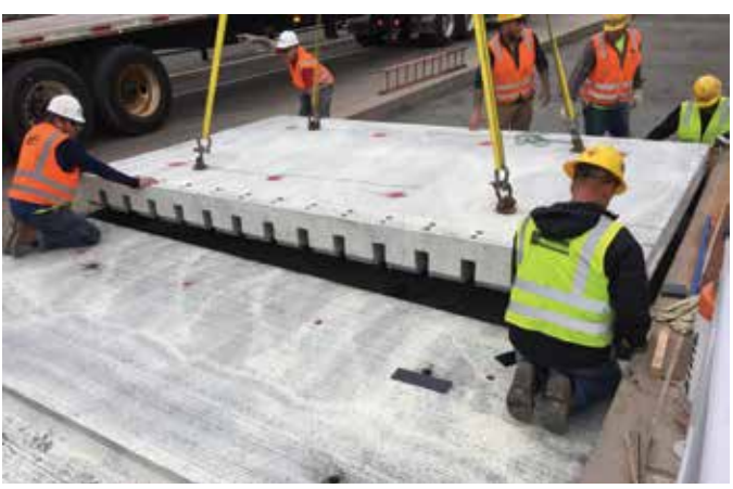
Fig. 3: Super-Slab® with dowel bar slots at bottom of panel

Dowel bar slots at the panel bottom—The proprietary Fort Miller Company (FMC) Super-Slab® system incorporates dowel bar slots at the slab bottom (Fig. 3). A flowable grout is used to fill the slots and the vertical gap along the four edges of the panel. The slot locations in a panel are positioned to match the locations of the projecting dowel