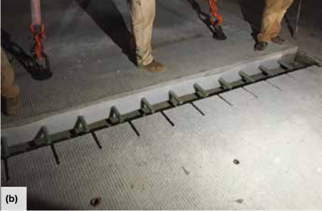
Fig. 6: California teardrop-shaped surface slot: (a) shape of slots; and (b) panel installation