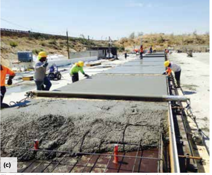
Fig. 8: Panel production using outdoor prestressing beds: (a) view of a prestressing bed; (b) panel hardware including prestressing tendons; and (c) concrete placement