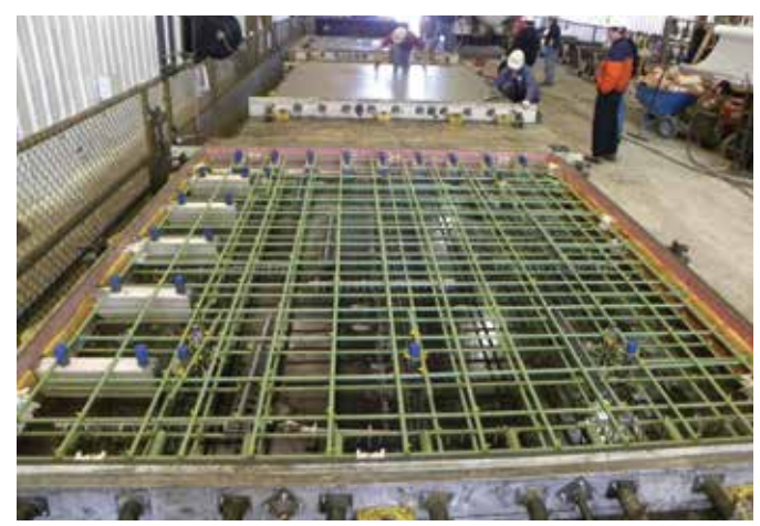
Fig. 7: Typical reinforcement layout