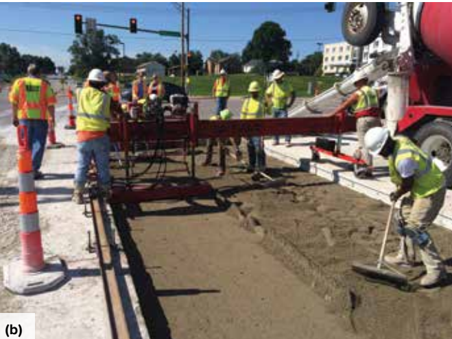
Fig. 1: Grade supported panel placement: (a) schematic; and (b) cement-treated bedding layer placement