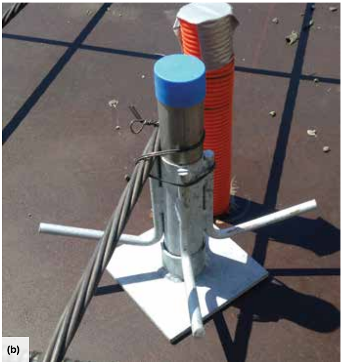
Fig. 2: Grout supported panel placement: (a) schematic; and (b) panel leveling lift system that also serves as a lifting insert

opening to traffic and about 3000 psi (20.7 MPa) at 28 days. Because the level of the upper surface can be adjusted to match the adjacent pavement, surface grinding of the panels may not be necessary to meet smoothness requirements.