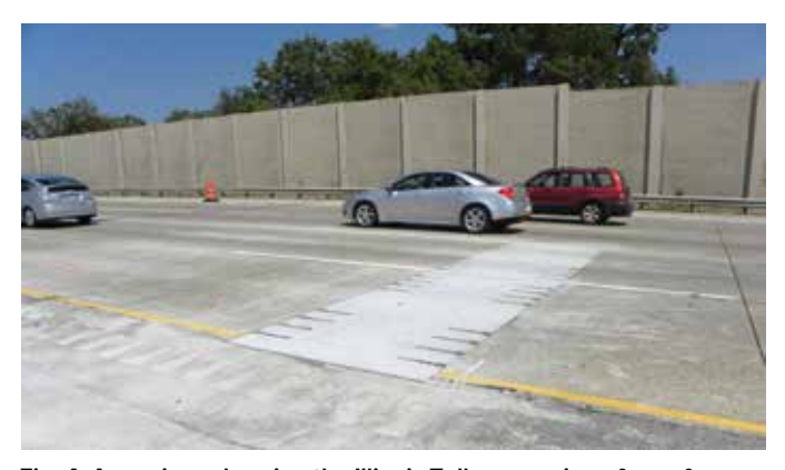
Fig. 4: A repair made using the Illinois Tollway version of a surface slot system